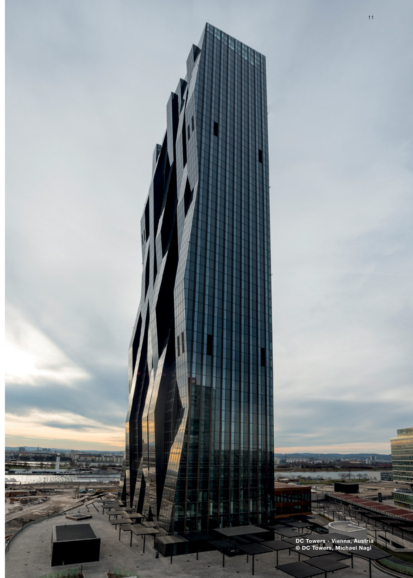
DC Towers - Vienna, Austria

T-Mobile Austria – Vienna, Austria Media City – Manchester, UK Aramco – Dhahran, Saudi Arabia Siemens AG – Karlsruhe, Germany MasterCard Head Offices – CA, USA Austrian National Bank – Vienna, Austria Rio Tinto – Perth, Australia Deutsche Telekom AG – Ismaning, Germany DC Tower I – Vienna, Austria Red Tower – Winterthur, Switzerland Cambridge Innovation Center – Boston, USA Daimler AG – Hamburg, Germany DHL HQ – Tema, Ghana Nestlé – Nunspeet, Netherlands High Chelmer Shopping Centre – Chelmsford, UK